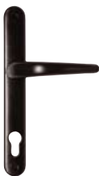
STB (Standard black)