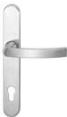
Style 253/270 Solid stainless steel handle with long back plate