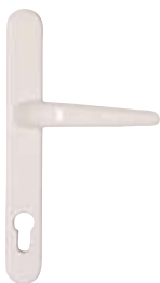
STW (Standard white)