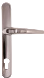
STC (Standard polished chrome)