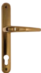
STG (Standard polished gold)