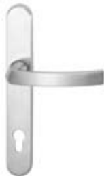
Style 253/270 Solid stainless steel handle with long back plate