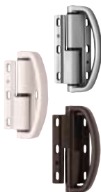
Hinges & D – Handle Available in satin stainless steel, white & black